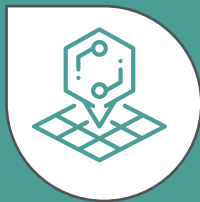
ABOVE-GROUND INSPECTION SERVICES

Calculate your pipeline's remaining useful life