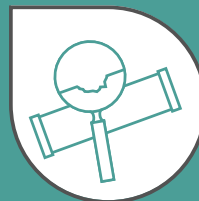
CORROSION CONTROL SERVICES