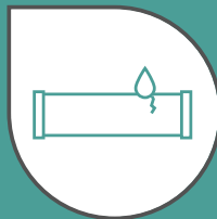
LEAK DETECTION SERVICES