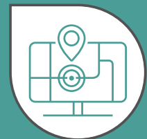
ADVANCED PIG TRACKING SERVICES

For more information, contact us at: info@corrprocanada.com